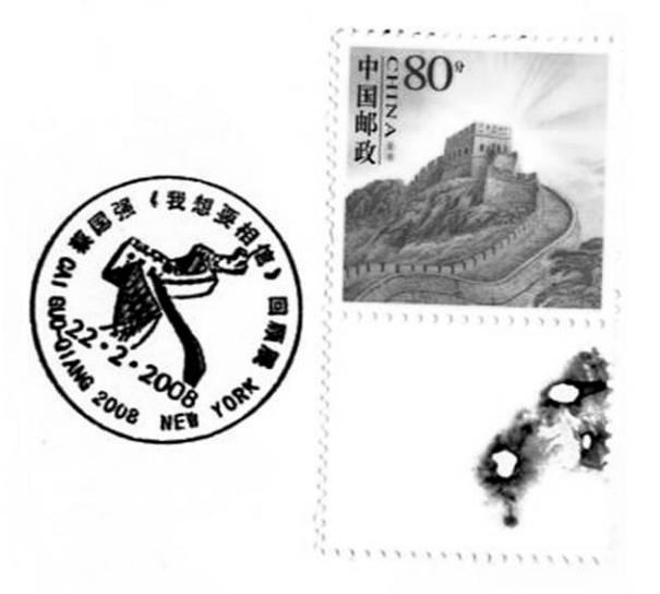
Figure 4: Cai's New York exhibit commemorated on a Chinese stamp

While he blows up Western icons, Cai embellishes China's sacred space. His explosive project at the Great Wall does not destroy this nationalist symbol; it actually extends the Great Wall by another ten kilometers. In 2008 this project was celebrated again when Beijing issued a special stamp of the Great Wall that is embellished with gunpowder art to recognize Cai's success in America. (see Figure 4)