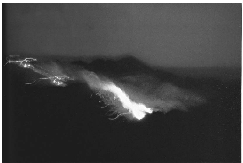
Figure 2: "Project to Extend the Great Wall" (1993)

Cai's explosive impact is not just metaphorical: he is most famous for using gunpowder creatively. In his early career in China, he experimented with gunpowder in painting to explode the conventions of traditional literati art. More recently, Cai has tried to get out of the art gallery by experimenting with fireworks at public events at places like China's Great Wall. (see figure 2). Since he came to the US in 1995, Cai has created massive explosion events that evoke joy and wonder for huge audiences, including a pyrotechnic tornado on the Potomac for the Kennedy Center's "Festival of China" in 2005. Many of these "explosion projects" are part of political events in China as well: in October 2001, Cai's official fireworks display celebrated China's hosting of the Asia-Pacific Economic Cooperation (APEC) meeting in Shanghai.